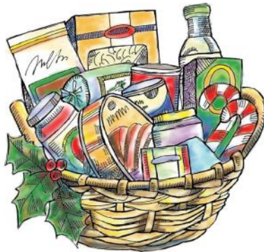
Reverse Advent Basket

(Item Ideas: shampoo, soap, deodorant, toothbrushes, toothpaste, pasta, canned goods, condiments, cake and brownie mixes, jello, pudding, cereal, socks, mittens, undies, children's books, crayons, toilet paper, etc.)