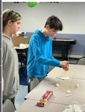
CONFIRMATION WINTER RETREAT 2025